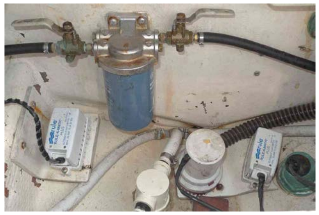
Left to right: High water alarm float switch Yamaha 10 Micron fuel filter & shut offs Raw water washdown inlet strainer Rule 2000 bilge pump & float switch

Airmar 600KW 50/200 Hz 20° tilted element transducer