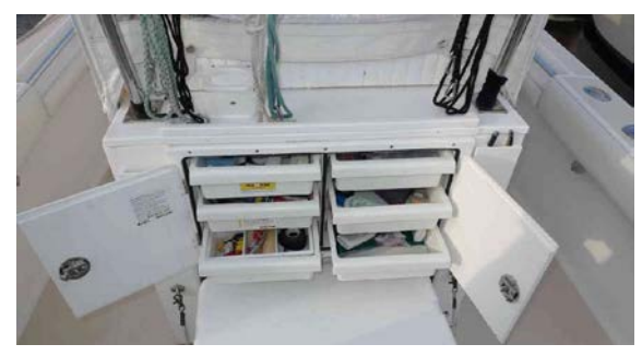
7/2012 Nautical Designs rigging station 6 aft opening drawers, gasketed/locking doors

Center mounted Structure Scan transducer